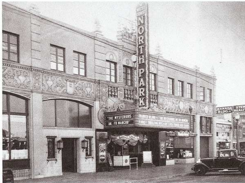
North Park Theatre, circa 1930