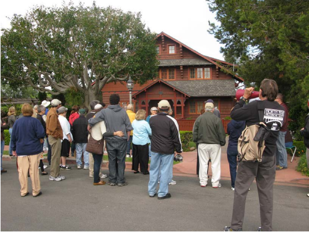
This romantic Swiss Chalet home on San Marcos Avenue is part of a trio forming a "diminutive alpine village" at the bend of the street