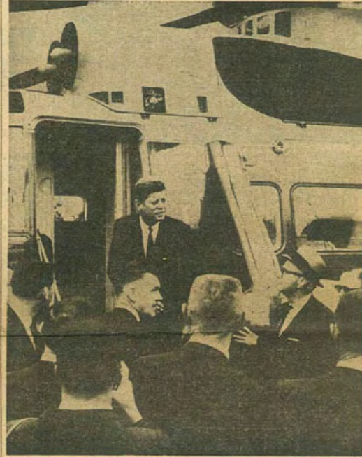
HAVING RECEIVED HIS HONORARY DEGREE, made his address to graduating class at San Diego State College, posed for press photographers and shaken hands with numerous "fans," President Kennedy pauses just before boarding helicopter to U. S. Marine Corps Recruit Depot where he inspected Marine recruits undergoing training.