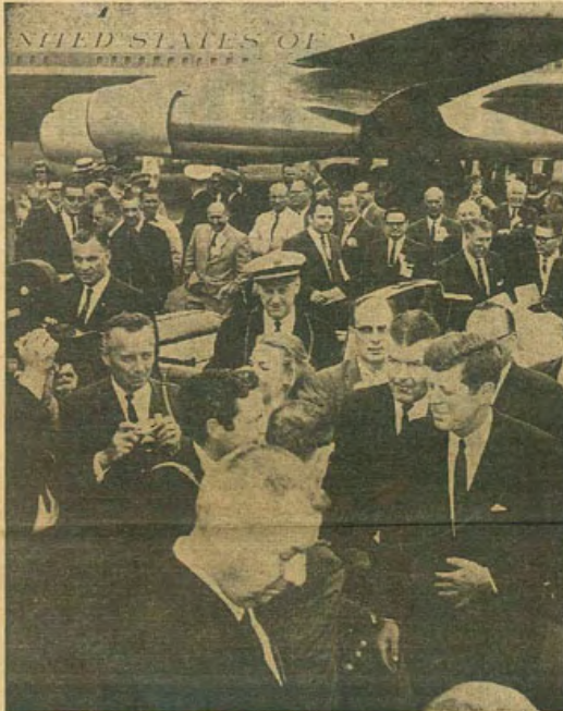
REPRESENTATIVES OF EVERY TYPE OF news media, military and civil dignitaries swarmed about President Kennedy on his arrival at Lindbergh Field, San Diego, yesterday morning. Press representatives were present by the hundreds, including local newspapers, TV and radio stations, and full complement of White House representatives.